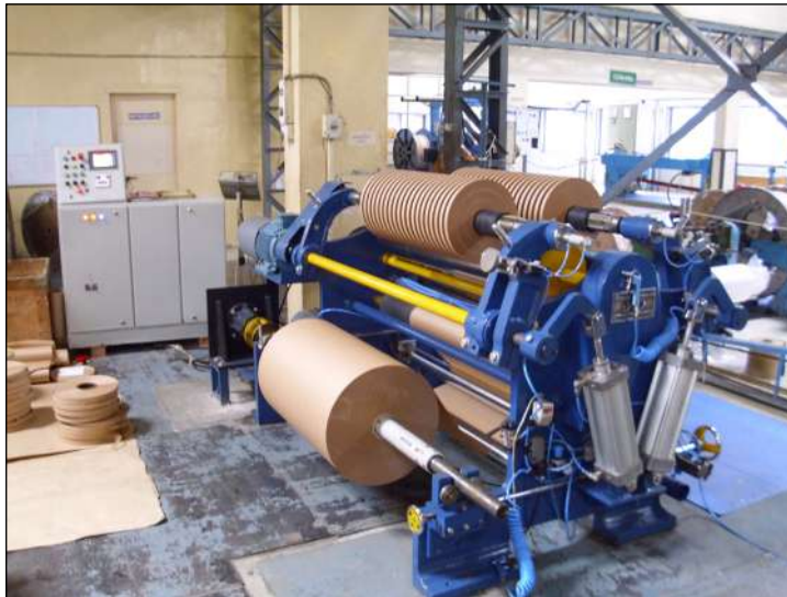
"MULTIWIND-II (S)" WITH DIGITAL FOUR-MOTOR SYNCHRONISED AC DRIVES