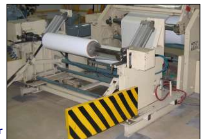
PNEUMATIC REEL LOADING SYSTEMS