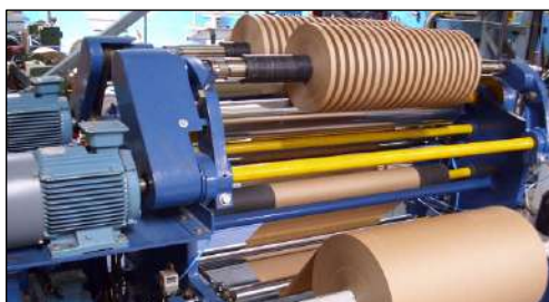
AUTOMATIC TENSION CONTROL SYSTEMS