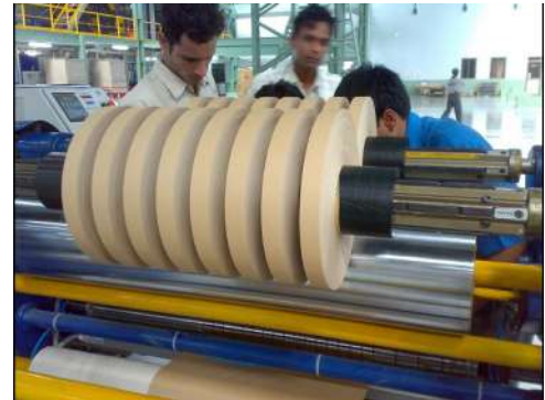
FLAWLESS SLIT REELS

This is a most versatile slitter, providing combination of Duplex Center-cum-Surface Rewind systems, suitable for all varieties of Papers, Films, Laminates, Aluminium Foil, Non-Woven Fabrics.